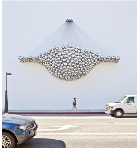
Cradle , 2010 by Ball Nogues Studio, Santa Monica, CA